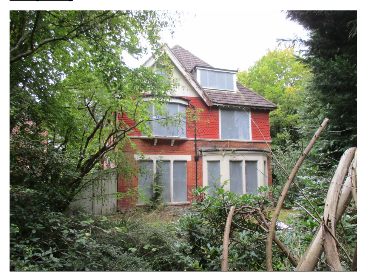
Rear of site