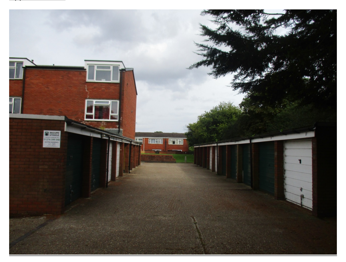
View from rear of site