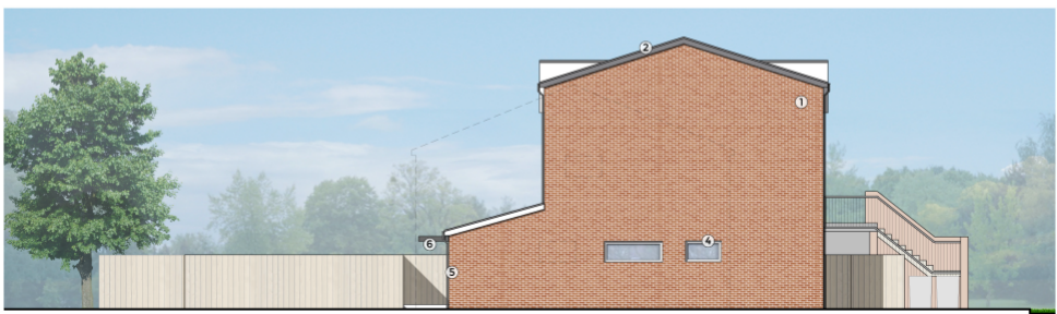
Side Elevation for Plot 3