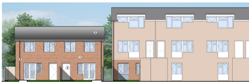
Rear Elevations for Plots 3, 4 and 5