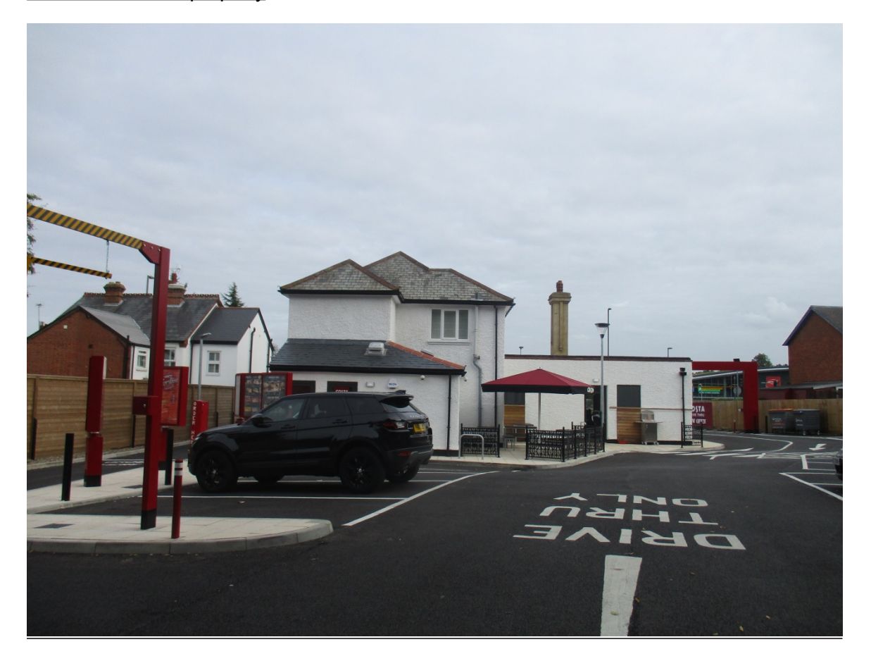
External lighting columns