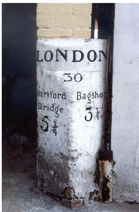
Image 1 Milestone, Bagshot