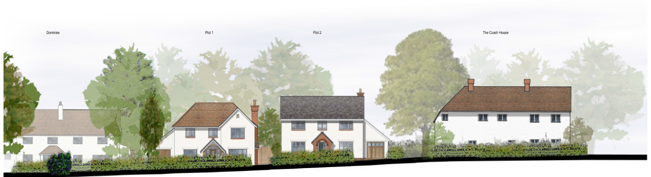
STREET SCENE TO HATTON HILL